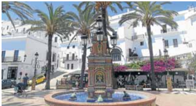
EMBLEMATIC: Vejer's main square and (right) Pajarra T-shirt shop

lage, exposed to the gusting Atlantic from its hilltop perch between the sea and the sierra. An unmissable component of any visit to the Costa de la Luz, the medieval quarter oozes history, its castle walls intertwined