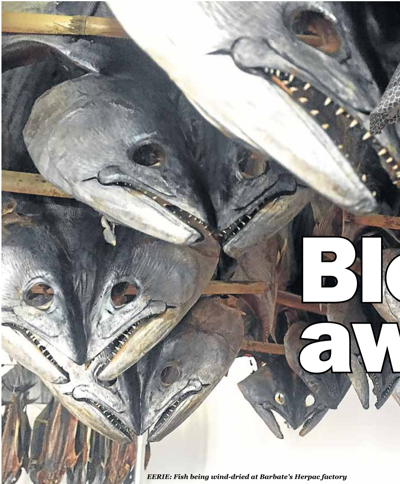
EERIE: Fish being wind-dried at Barbate's Herpac factory