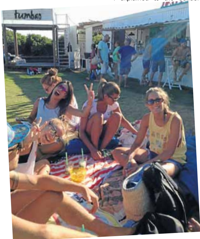
CHILL OUT: Young holidaymakers at Tumbao