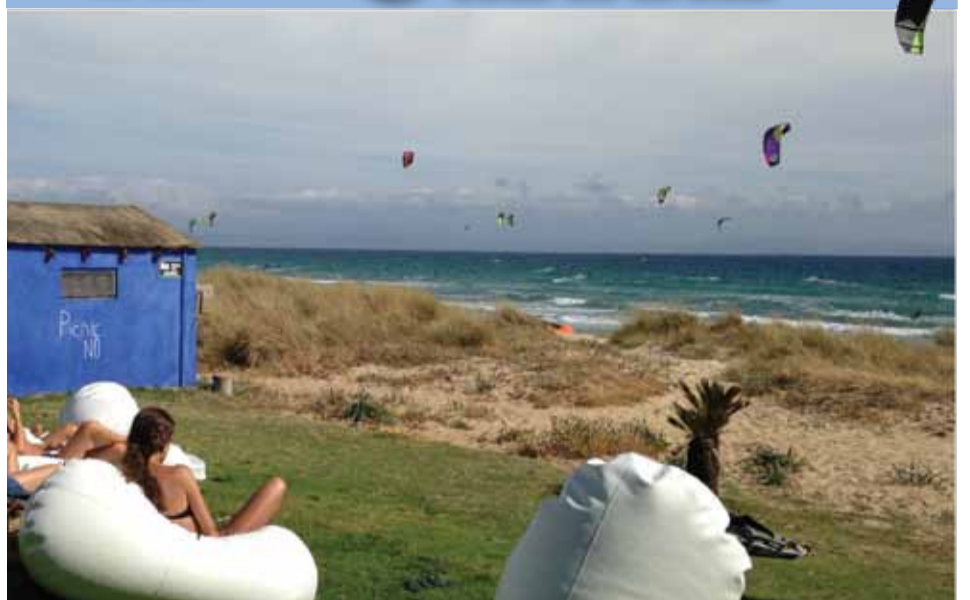
SUNKISSED SPECTATORS: Kitesurfing is the best free show in town