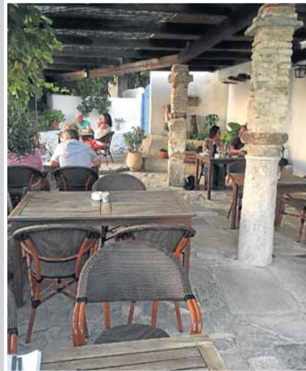
CHARMING: Patria's flagstone terrace

"It is all about being able to adjust, change and cre-