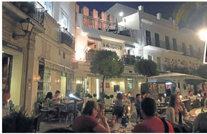
MAGICAL: Garimba in the main square has a superb mix of tapas

The Madrilenos' bustling restaurant serves up a fabulous mix of excellent value tapas, not to mention amazing tuna and steaks.