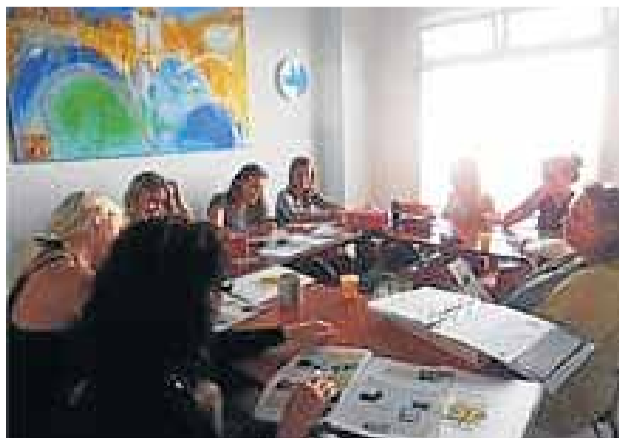
BACK TO SCHOOL: Hispalense students