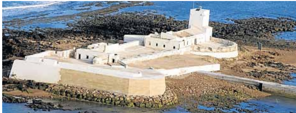
HISTORIC: Sancti Petri castle is the stuff of legends

Hercules' legacy survives today through a statue at the marina entrance and - as if that wasn't enough - a street name. Meanwhile, Roman emperor Julius Caesar is said to have