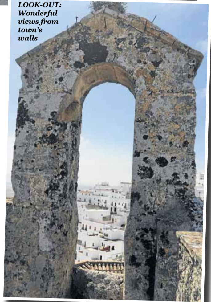
LOOK-OUT: Wonderful views from town's walls

up to the turreted walls, from where views spread out across cultivated fields to the mountains and the 5,000 hectare Las Brenas Natural Park. It's easy to see why this immaculate village was voted second Most Beautiful in Spain on Trip Advisor. There is certainly something special about Vejer, which