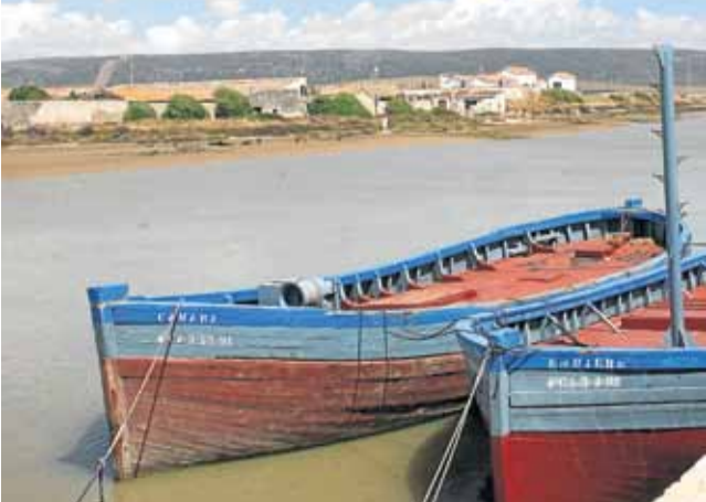
SCENIC: An inlet between Barbate and Zahara

It only seemed right to try some so I ordered up a slab of juicy red tuna steak and ate it while watching the moonlight on the water. After a day discovering the peachy beaches of the Costa de la Luz, there can be no more fitting a finale.