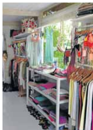
Hip: At Graffiti

"It's Mojitos from 3pm but it creates a great atmosphere and it is surprising how many people end up renting out paddle surfs or taking a kitesurf lesson."