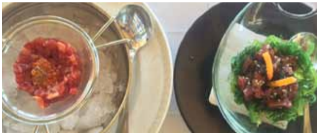
BATTLE: Two types of tuna tartare at Antonio's

Finally, over in Vejer you will find an amazing mix of good places to eat, including Patria, Corredera 55, Califa and Castilleria... Turn to page 25 for a more in-depth look.