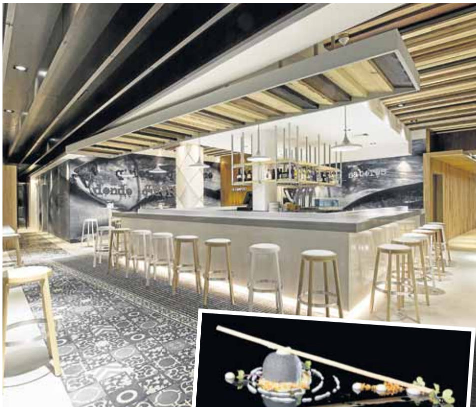
COASTAL LEADER: Campero and (inset) a creation