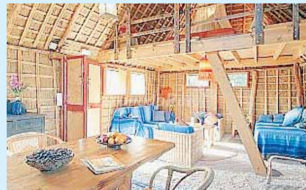
HIPPY CHIC: Luxurious Casas Karen