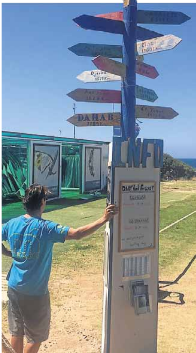
CHILLED: Signposts to the world's kitesurf capitals