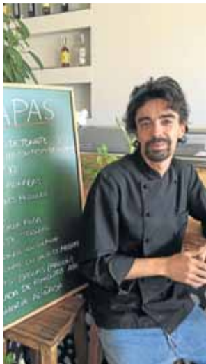
NEW BROOM: Mourat at 7

A PPROPRIATELY named Tesoro (treasure), it is very much a treasure hunt arriving at what is easily one of Andalusia's most charming places to eat. High up in the hills between Tarifa and Bolonia, it takes a good deal of wit and guile to continue on the track to the pot of gold at the end of the rainbow. But it is well worth the trip, with owners Jesus and Juana, creating a genuine paradise overlooking rows of vines and a sea of undulating umbrella pines. Aside from the fabulous food