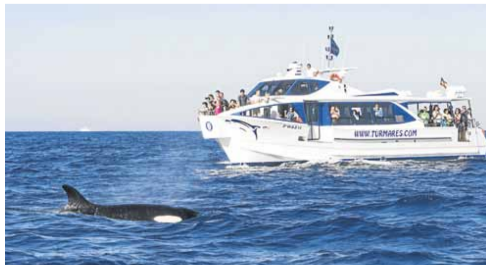
COMING TO A SHORE NEAR YOU: Whales in Straits of Gibraltar, and (below) tuna half-eaten by orcas