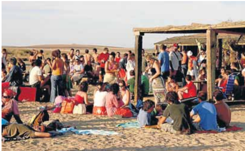
VARIETY: From hip Canos de Meca to wide open Chiclana (top) and Conil (inset)

It is actually possible to walk the entire stretch of unbroken sand between Conil and Los Canos de