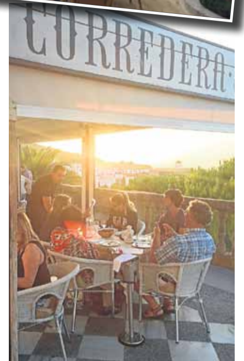
OFFERING: Califa (top) and Corredera 55 are highlights

Creativity comes in droves and the wine list is one of the best in Cadiz, with a rich and varied mix of bottles.