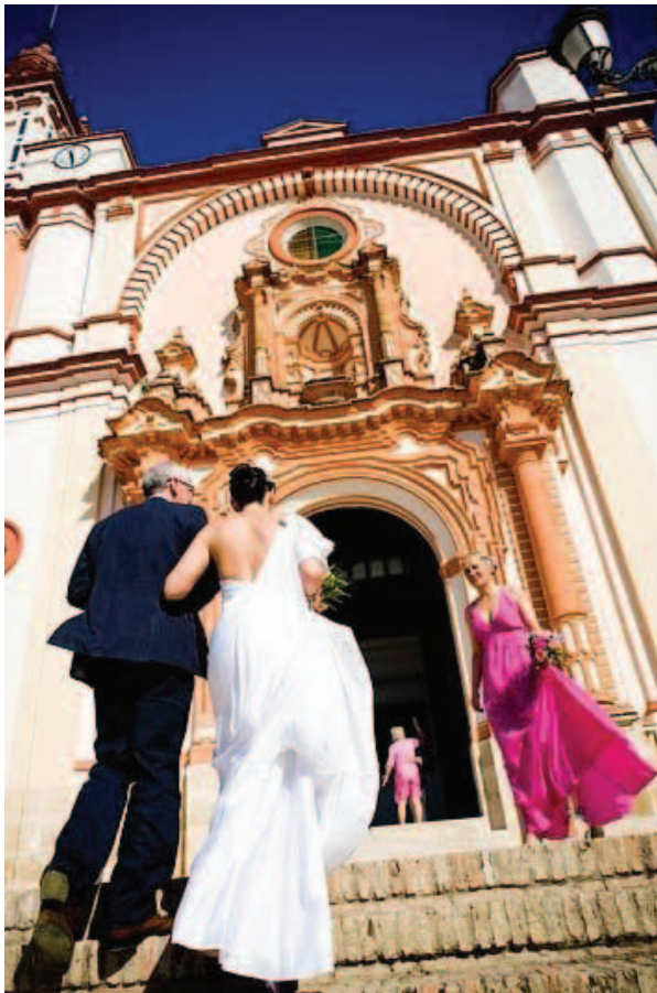
ANDALUZ: Wedding at church in Cabezas de San Juan organised by Hacienda de San Rafael