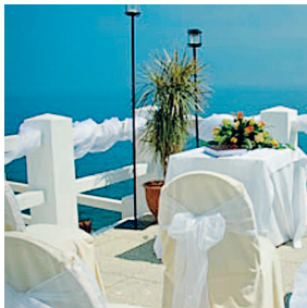
CHOICE: (clockwise from top) Los Caballos, Fairplay, La Caleta and La Vista